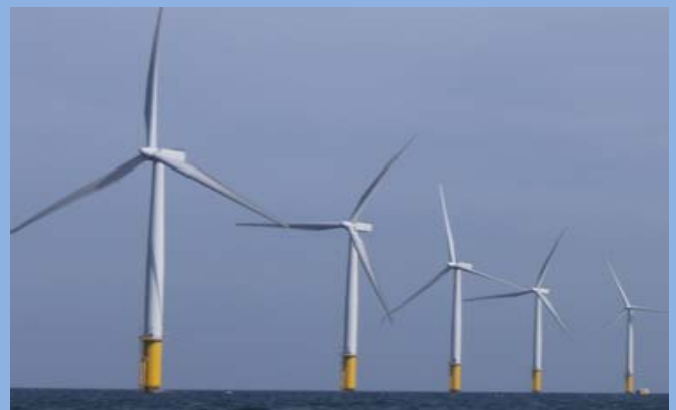
Wind farm off the Norfolk coast, UK.