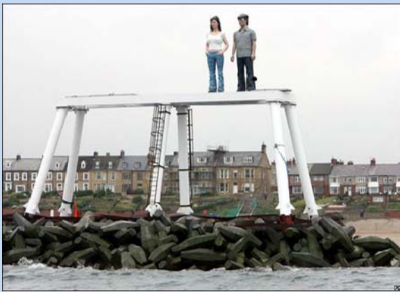
The sculpture, known as "Couple", stands on top of a protective breakwater in Newbiggin, UK.

Offshore Wind Farms: Envision has undertaken benthic habitat assessments as part of the EIA associated with applications for wind farms and cable corridors that require information on seafloor sediments, seabed morphology, habitats (particularly those of high conservation interest) and wrecks. Envision: